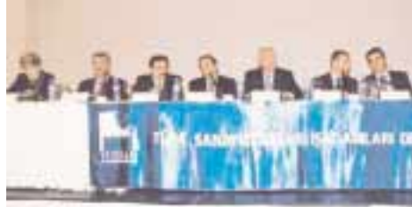
The participants to the meeting