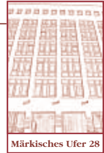
Märkisches Ufer 28

For the second half of the year, TÜSIAD Berlin Office is planning two top-level conferences in Frankfurt and Berlin about Turkey's economic integration into the EU and Turkey-EU relations in the framework of upcoming membership negotiations. The visit of another high-level TÜSIAD Delegation is also being organized for the end of September.