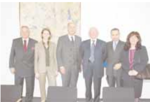
TÜSIAD Delegation to Berlin on 12 - 13 February