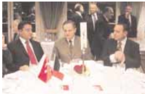
The opening ceremony of the Paris Office