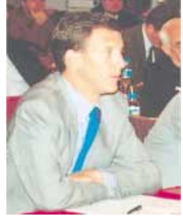
Prince Joachim of the Kingdom of Denmark