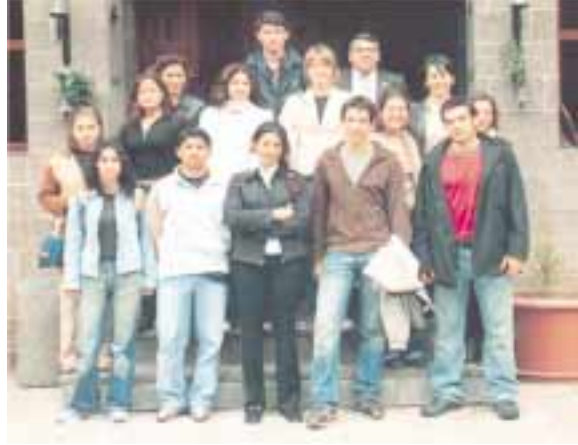
High School Students in Diyarbakır